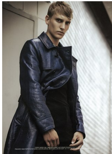
Model: [unreadable]