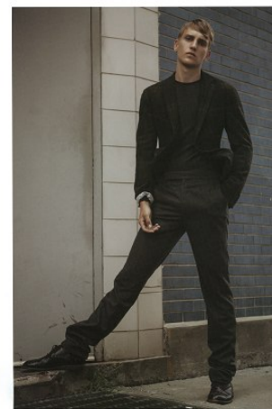
Model: [unreadable]