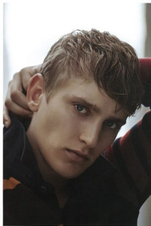
Model: [unreadable]